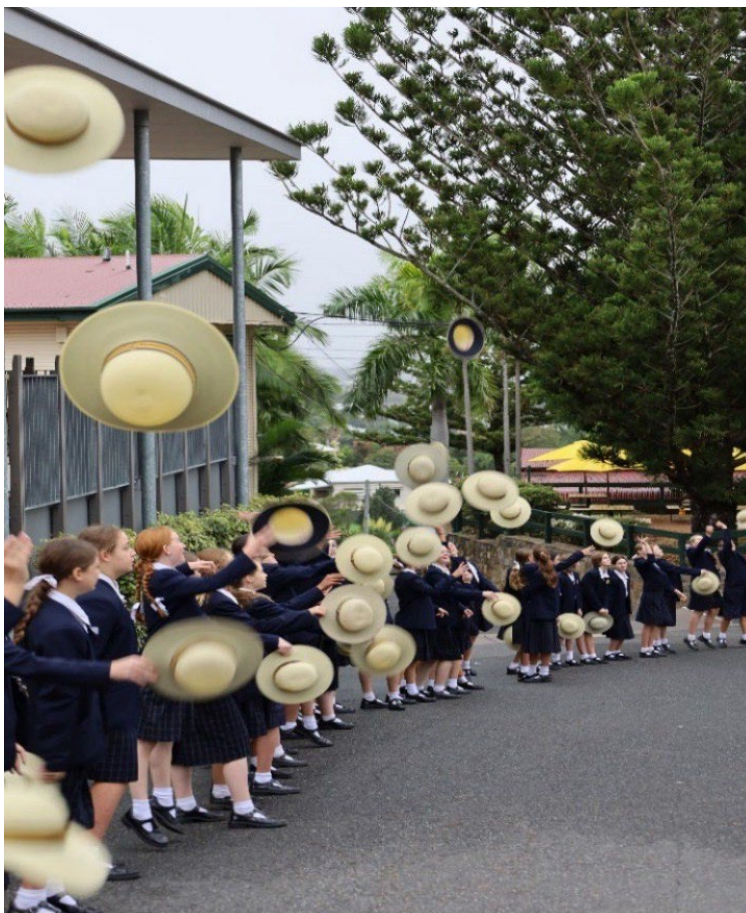
Throwing of Hats – Foundation Day 2024

Please sign and return the acknowledgement on the following page to the Enrolments Officer at Enrolments@rggs.qld.edu.au .