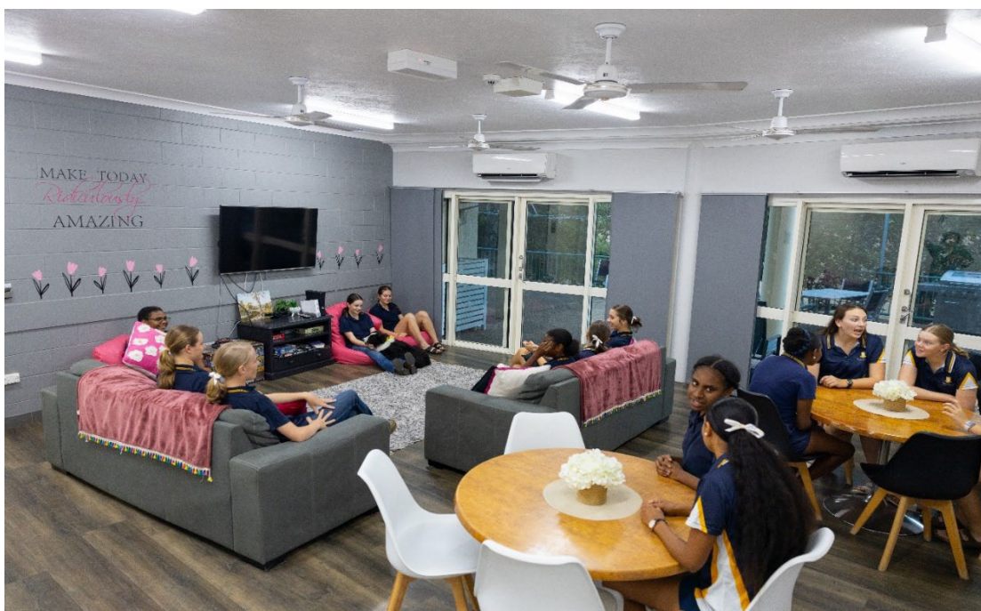
Jackson House Boarding – Common Space

make the transition as seamless as possible for our girls as they settle into their “home away from home”.