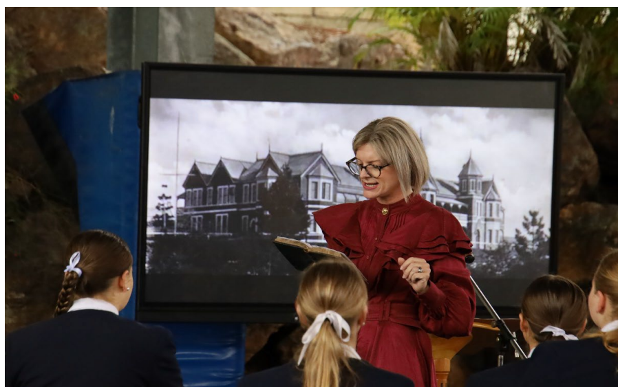
Foundation Day 2024