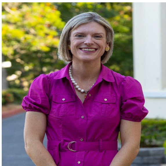
Deputy Principal Studies