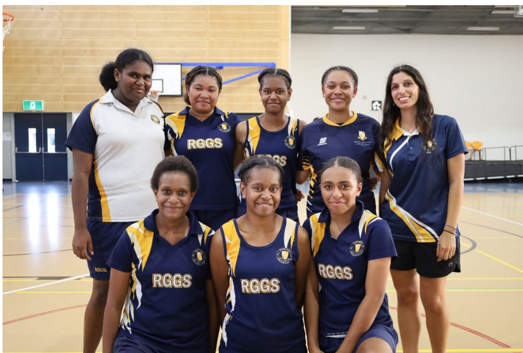
Rockhampton Girls Grammar Basketball Team 2024

For parents who may be visiting Rockhampton, both taxi (link below) and uber (download app) services are available: